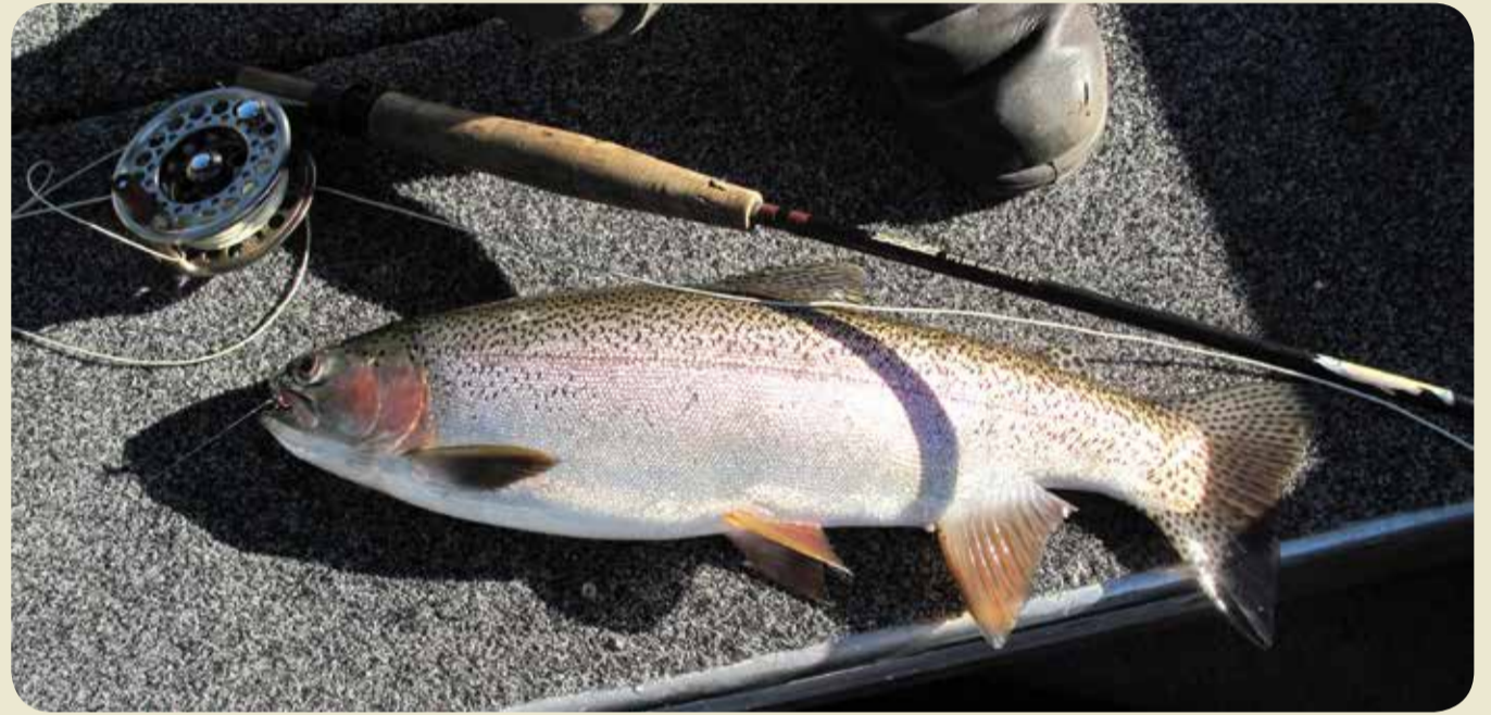
Brown and Rainbow trout